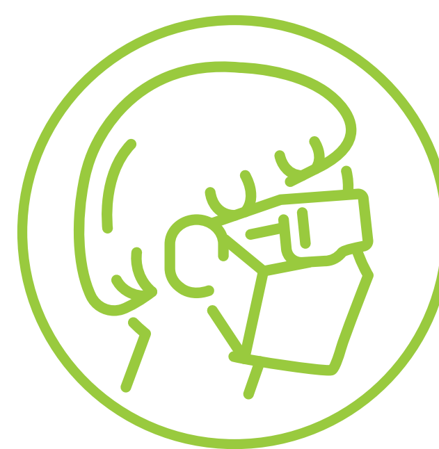
Hair Confinement (beard net as needed)