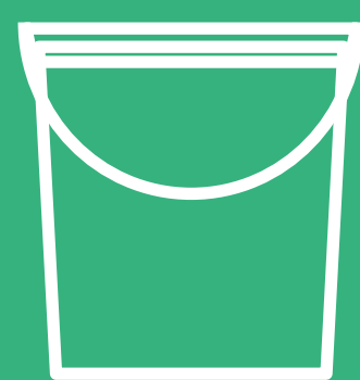
2+ gallon bucket to catch gray water