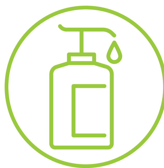
Hand washing & sanitation kits