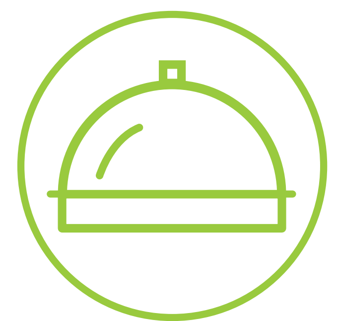
Food cover/ Sneeze guard